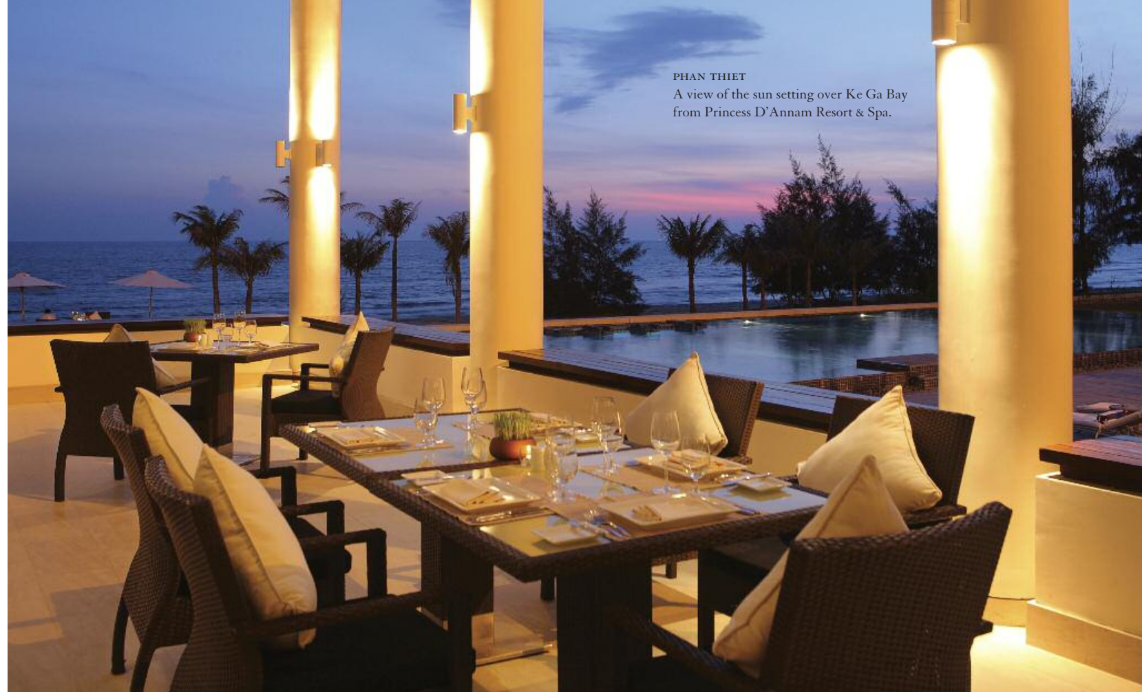
PHAN THIET A view of the sun setting over Ke Ga Bay from Princess D'Annam Resort & Spa.