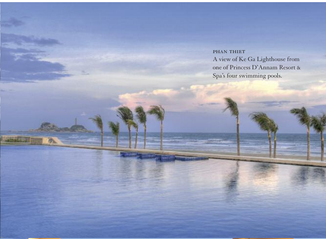
PHAN THIET A view of Ke Ga Lighthouse from one of Princess D'Annam Resort & Spa's four swimming pools.