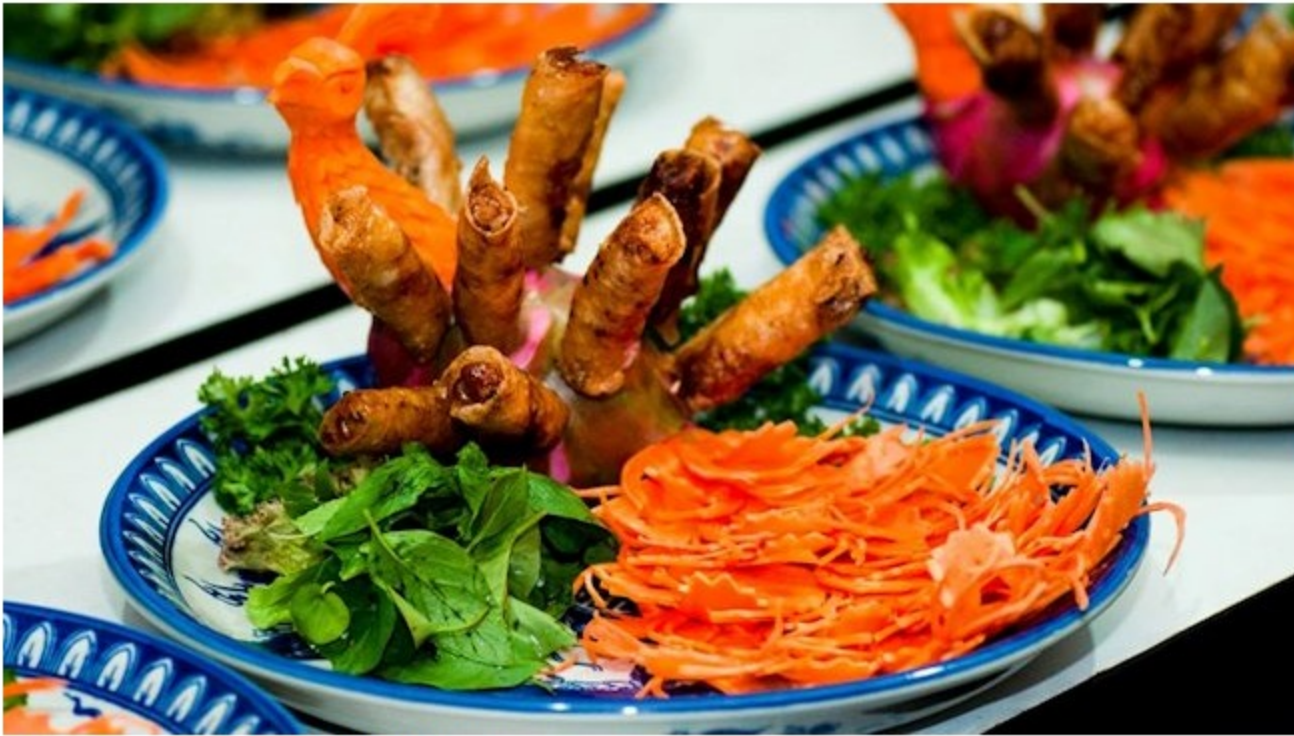
A dish from a royal dinner in Hue, Vietnam

In all, the Hue Food Trail takes in eight different dining opportunities independent of the hotel. At the same time, the hotel supplements these off-site excursions with on-site introductions to traditional Hue cakes, cocktails stirred up with local ingredients and the coup de grâce, an imperial dinner inspired by the banquets prepared for the Nguyen emperors of Vietnam.